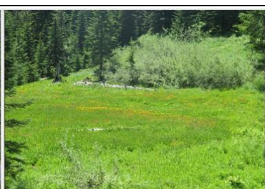
Quartzville Creek starts in this meadow