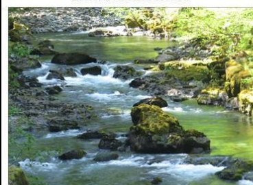
Upper Unprotected section