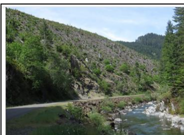
Lower Protected section

Priscilla Macy, American Whitewater priscilla@recreate-consulting.com